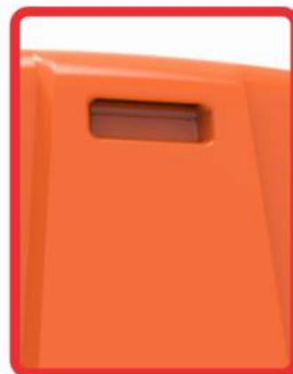
HANDLE TO MANAGE