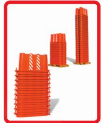
STORE UP TO 99 PCS PER PALLET