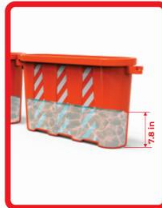
WATER FILLING (maximum of 7.8 in)