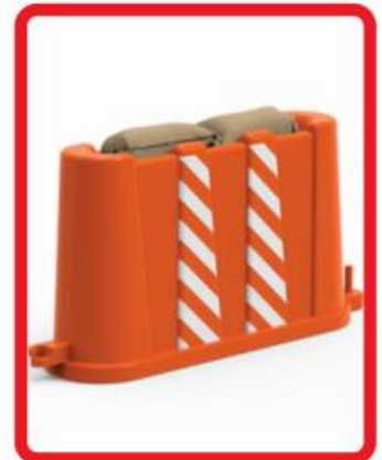
2 SAND BAGS OF 22 LBS EACH (OPTIONAL)