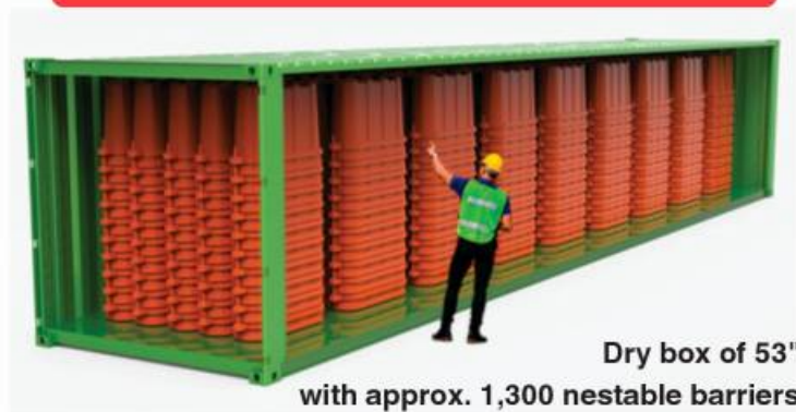
Dry box of 53" with approx. 1,300 nestable barriers. Channelize up to 6397 linear feet.