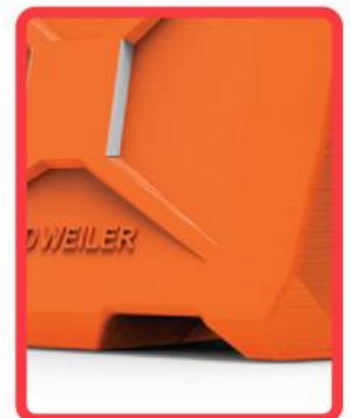
Bridge (water flow)