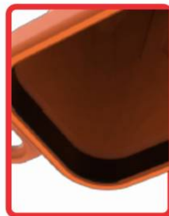
HANDLE TO MANAGE