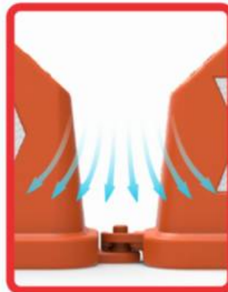
SAFE COUPLING WITH A PRECISE WIND FLOW AND AVOID TILTS