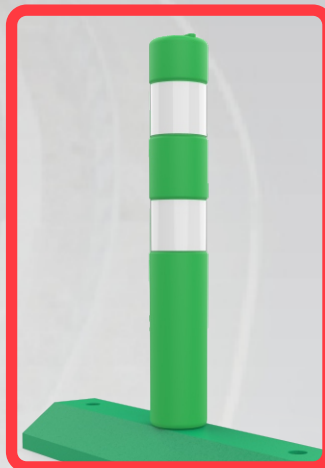
With Poliflexy® 66 Bollard (code: ITO-PF-66)