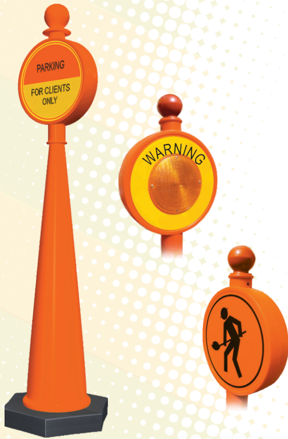
The images are merely representations of the models.