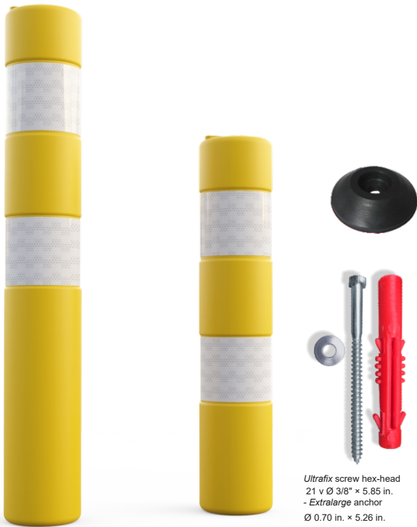
Ultrafix screw hex-head 21 v Ø 3/8" x 5.85 in. - Extralarge anchor Ø 0.70 in. x 5.26 in.

It's recommended mainly in rows making it impossible for vehicles to try to park on the sidewalks or invade dangerous areas.