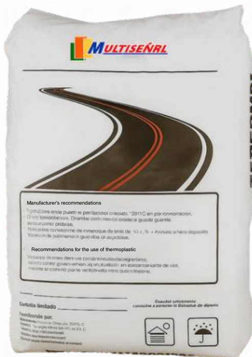
PACKAGING 44.09 lb heat-degradable bag