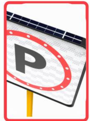
Solar cell at top part