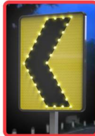
CHEVRON IN RIGHT DIRECTION TO INSTALL IN THE SIDE OF CENTER LANE SEPARATOR