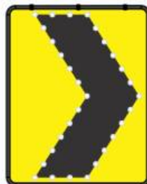
CHEVRON IN RIGHT DIRECTION