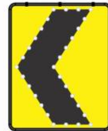
CHEVRON IN LEFT DIRECTION