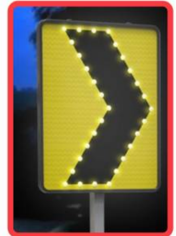
CHEVRON IN LEFT DIRECTION TO INSTALL IN THE SIDE OF SHOULDER (ROAD)