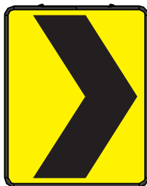
RIGHT CHEVRON SIGN