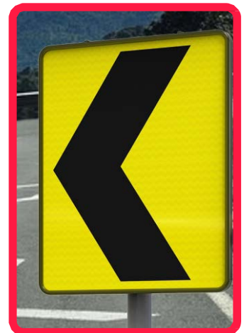
THE LEFT CHEVRON SIGN CAN BE INSTALLED ON THE SIDE OF BREAKDOWN LANES