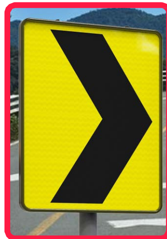
THE RIGHT CHEVRON SIGN CAN BE INSTALLED ON THE SIDE OF THE MEDIAN STRIPS