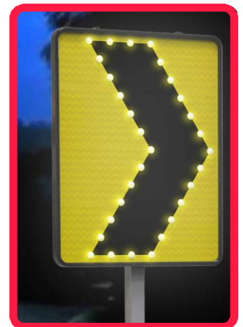
THE LEFT CHEVRON SIGN CAN BE INSTALLED ON THE SIDE OF BREAKDOWN LANES