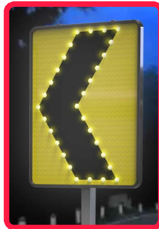
THE RIGHT CHEVRON SIGN CAN BE INSTALLED ON THE SIDE OF THE MEDIAN STRIPS

2-year warranty against manufacturing and hidden defects under normal conditions of use.