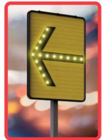
ARROW IN LEFT DIRECTION