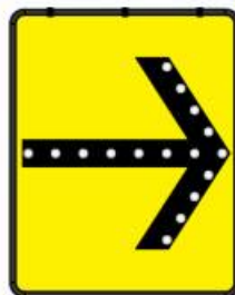
ARROW IN RIGHT DIRECTION