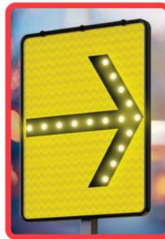
ARROW IN RIGHT DIRECTION