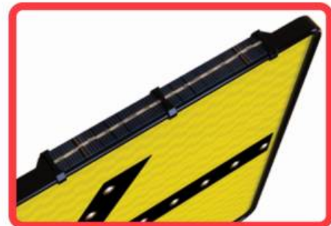
1.5 X 15.7 in PHOTOCELL MOUNTED ON TOP PART OF SIGNAL