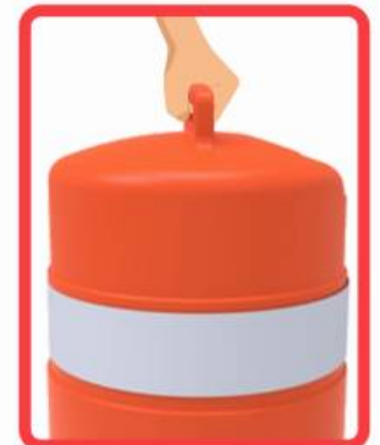
Grip to handle