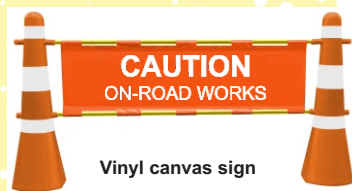
Vinyl canvas sign