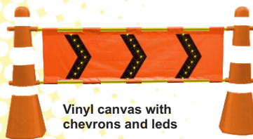
Vinyl canvas with chevrons and leds